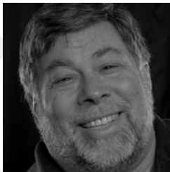
Steve Wozniak Co-Founder of Apple Inc.