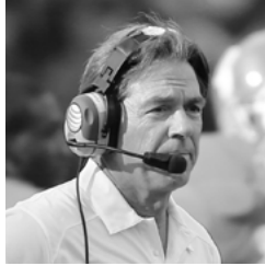
Nick Saban Head Football Coach at The University of Alabama