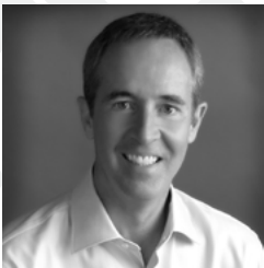
Andy Stanley Leadership Author & Communicator